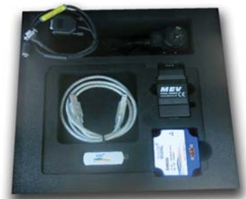
DMU30 EVK Evaluation Kit (P/N DMU30-00-0500)

For full technical datasheets please visit: www.siliconsensing.com